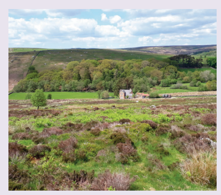
Goathland Moor, looking towards Wheeldale Lodge, showing the typical pattern of mixed-use agriculture of the North York Moors, including moorland, pasture and woodland.

As evidenced at a Heather Trust public event involving the Goathland Moor Regeneration Group in 2019, public engagement activities can enhance the relationship between