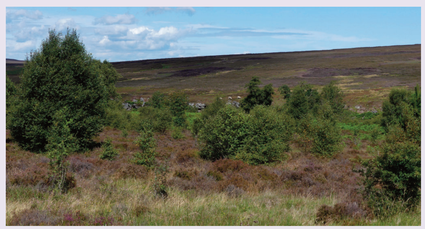
Fen Bog Nature Reserve, looking towards Goathland East Moor (beyond the drystone wall), showing the difference between the more varied mosaic of vegetation of the nature reserve and the moorland beyond, managed principally for grouse and sheep.

From 2017-2021, Dr Tom Ratcliffe conducted a PhD research project into how people identify with landscapes within the North York Moors and the role communities have in influencing decisions about landscape protection and change. The project was a study of the viewpoints held by a wide range of communities and other key National Park stakeholders and how they connect with the landscapes. Key stakeholders interviewed included the National Park Authority, other government bodies, conservation organisations, landowners, land managers, developers, and local voluntary groups. Tom conducted 58 interviews and used 'walking interviews' as his primary method of data collection. Following on from his article in the Autumn edition of Voice of the Moors about walking interviews, this article outlines some of his findings concerning land ownership, management and community participation as we face up to the biodiversity and climate emergencies.