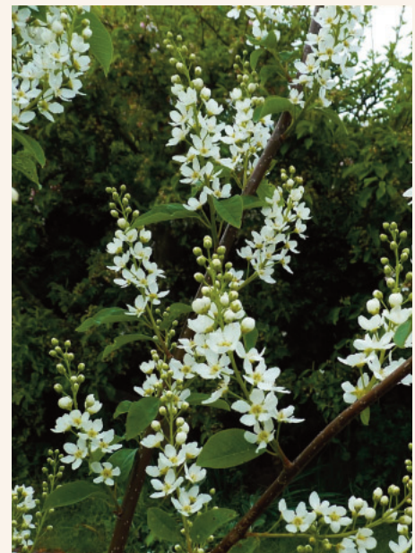
Wild cherry tree