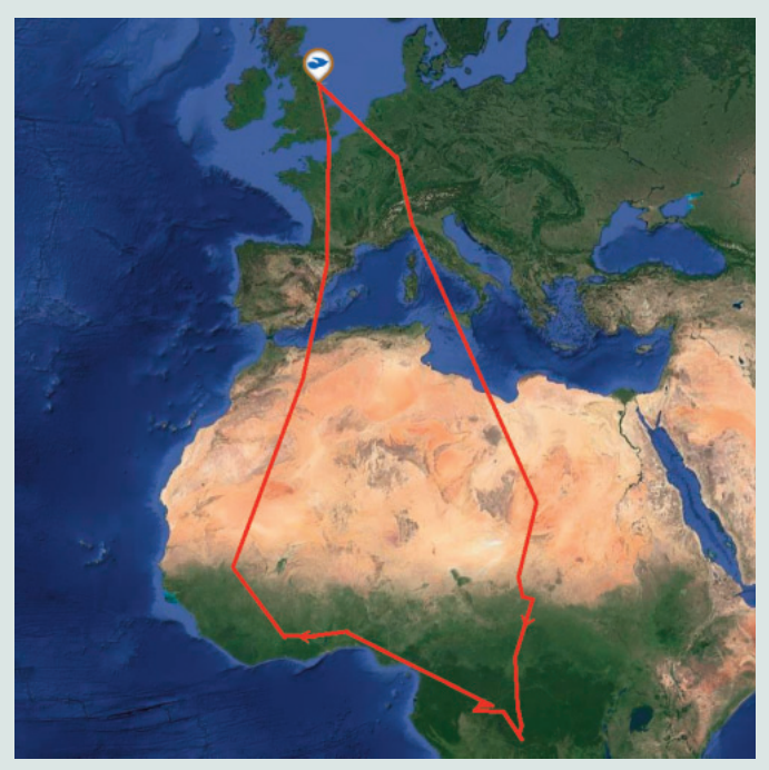
Migration route of Coo the Cuckoo