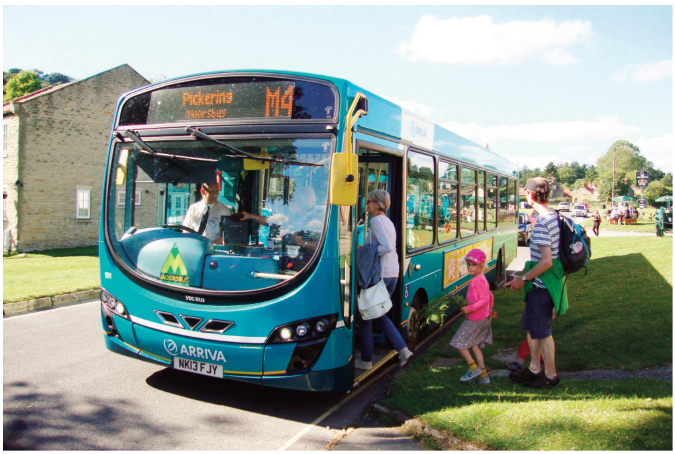
Moorsbus at Hutton-le-Hole

F YOU live in the North York Moors, whether or not you are a member of NYMA, you are almost certainly heavily dependent on your car to support your way of life – to get to work, to visit friends and family, to shop, to get to the doctors' surgery or make a hospital visit.