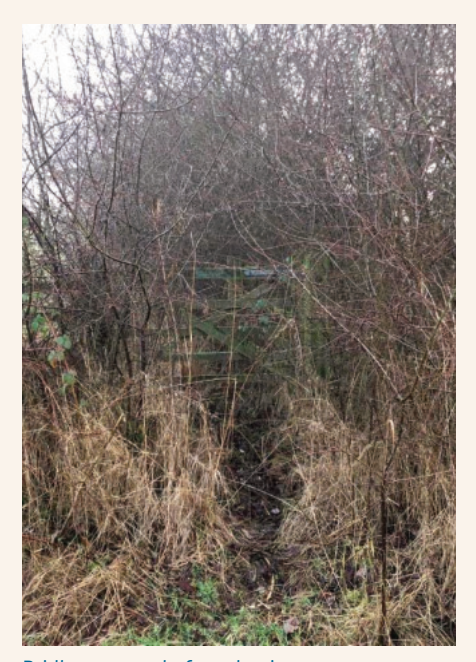
Bridleway gate before clearing

HIS IS a project to improve three bridleways that come together just outside the village of Sproxton, a mile or so south of Helmsley.