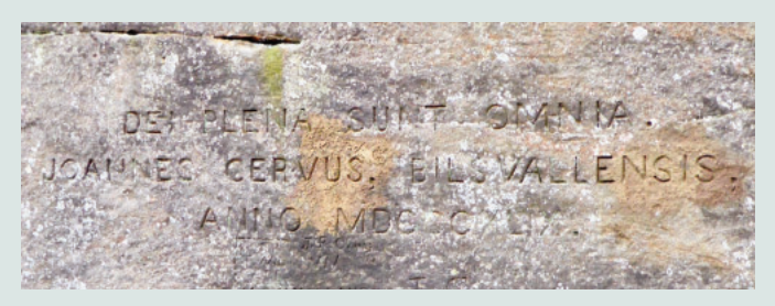
Inscription on the Ship Stone

The name 'Thripesdala' appears in the 12th century Rievaulx Chartulary. The name may come from the Old English word 'Thripple, a moveable framework fitted on a cart', or 'Thripel', meaning 'instrument of torture'. Having visited Tripsdale at the height of the bracken and midge season I think the derivation from Thripel is the most appropriate!