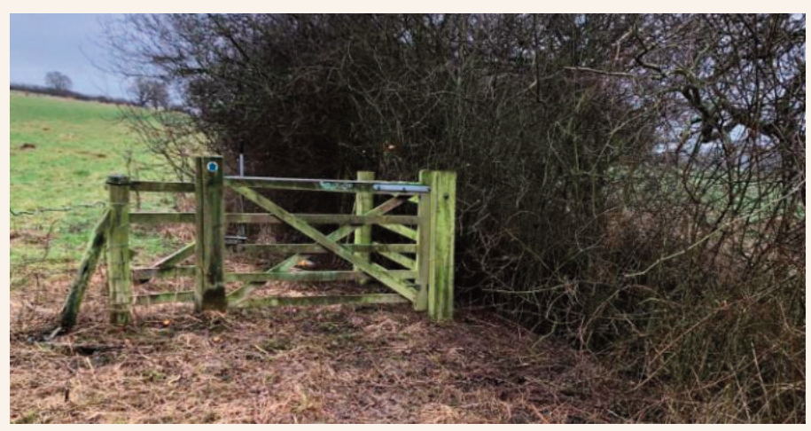
Bridleway gate after clearing

Previously, a number of volunteers from the Ryedale Bridleways Group had been instrumental in the repair and renewal of a bridge over which one of the bridleways was routed (across White Beck, a tributary of the River Rye), and once this was achieved the focus turned to a