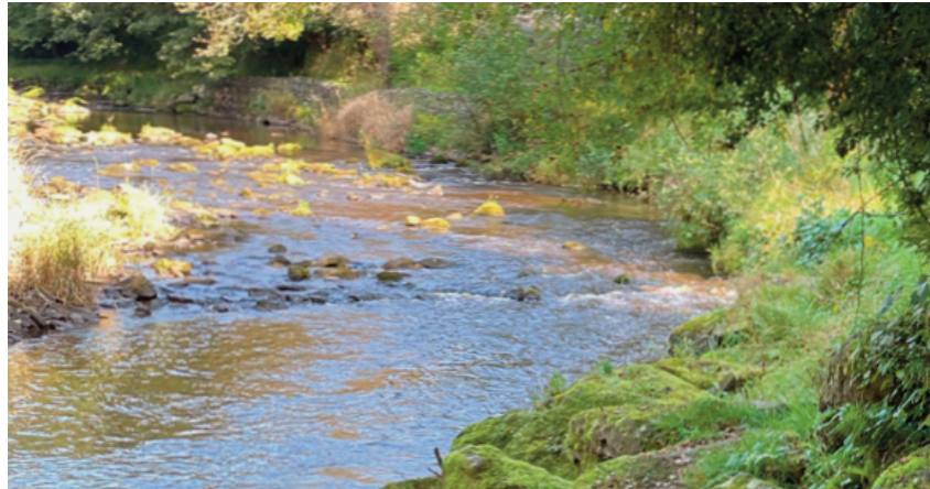
Leaking sewage pipe, Egton Estate