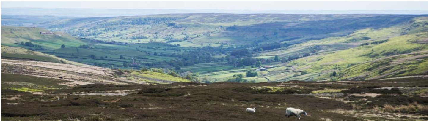
The view down Rosedale from close to Elgee's memorial stone